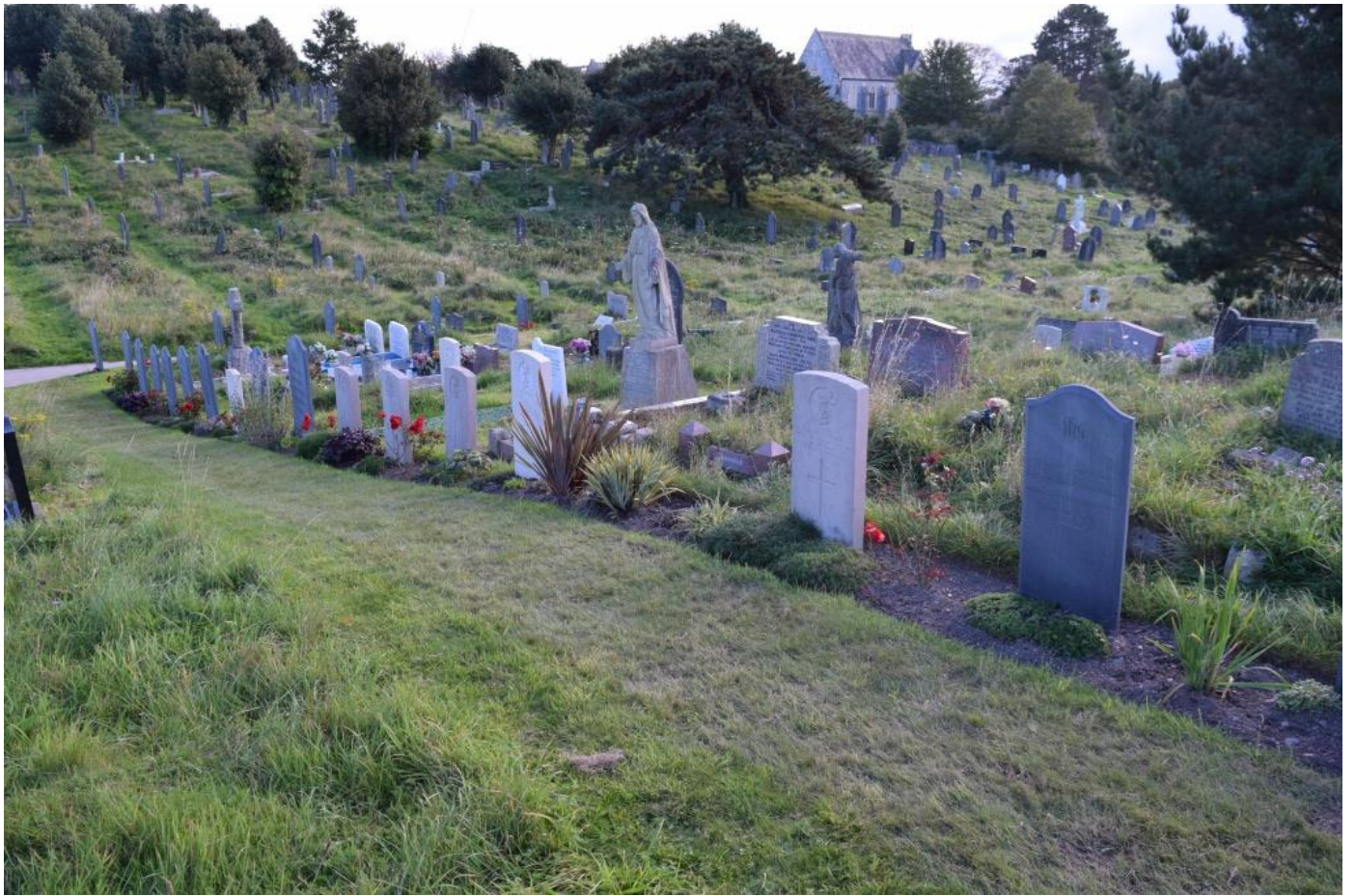
Ford Park Cemetery, Plymouth