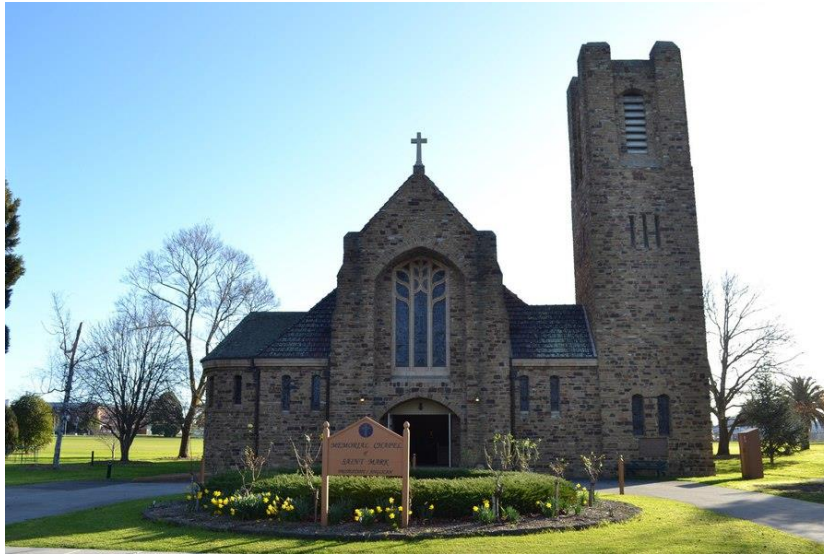
HMAS Cerberus Protestant Chapel of St Mark, Crib Point, Victoria