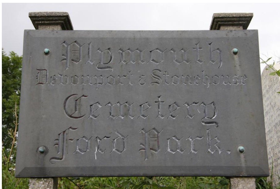
Ford Park Cemetery, Plymouth

Ford Park Cemetery (formerly known as Pennycomequick or Plymouth Old Cemetery) contains 769 burials of the First World War, more than 200 of them in a naval plot, the rest scattered throughout the cemetery. All of the 198 Second World War burials are scattered, 1 of which is an unidentified airman of the Royal Air Force. There are a further 4 Foreign National and 1 non world war service burials here. (Information from CWGC)