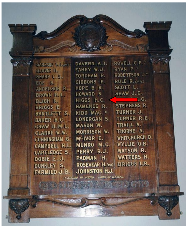
Launceston High School Roll of Honour