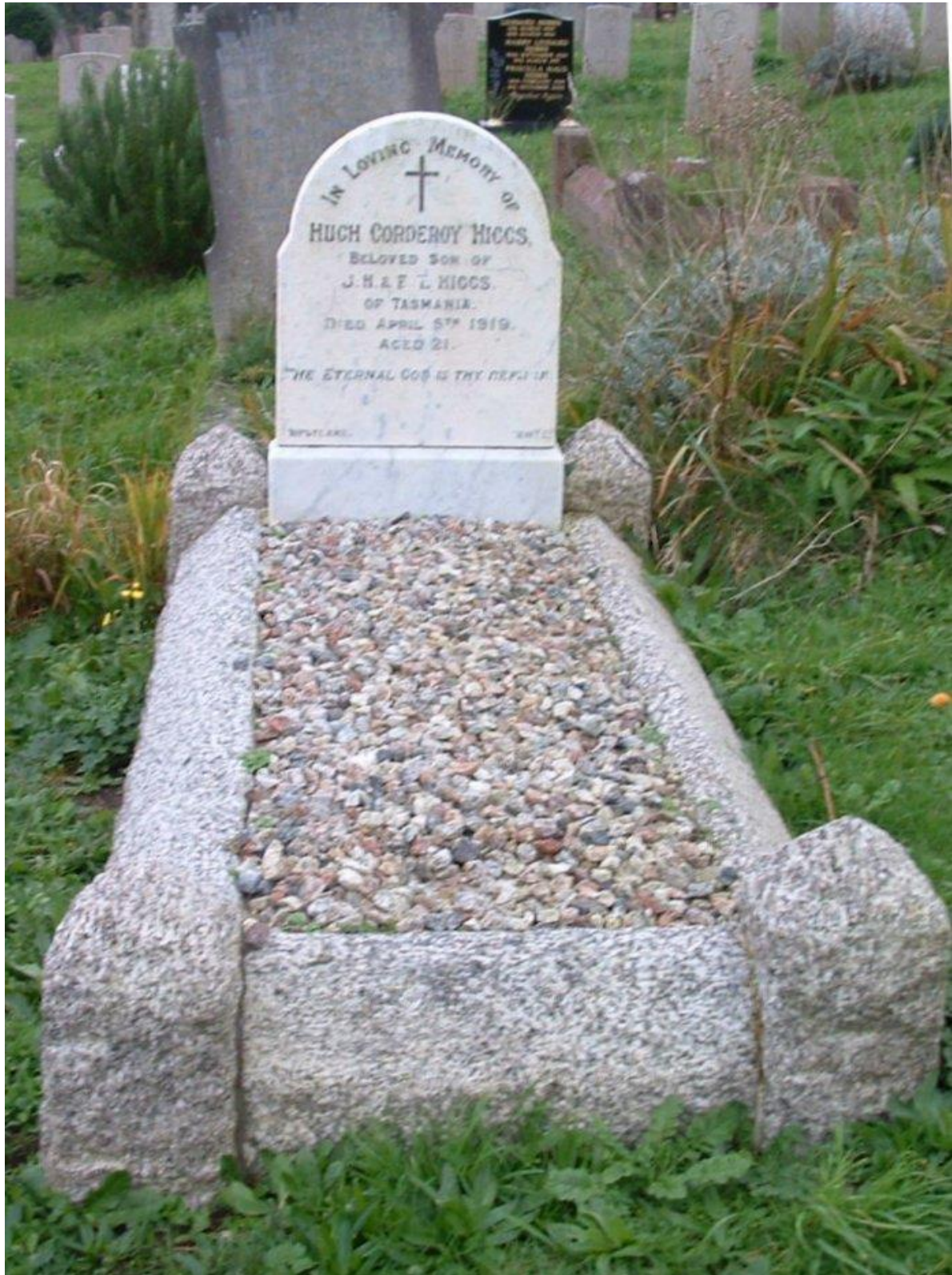
Photo of Leading Signalman Hugh Corderoy Higgs' Private Headstone in Ford Park Cemetery, Plymouth, Devon, England.