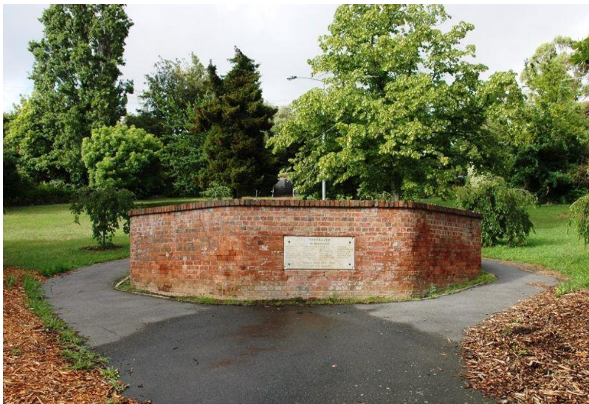
Trevallyn Roll of Honour

H. Higgs is remembered on the Trevallyn Roll of Honour, located in Trevallyn Reserve, South Esk Road, Trevallyn, Tasmania.