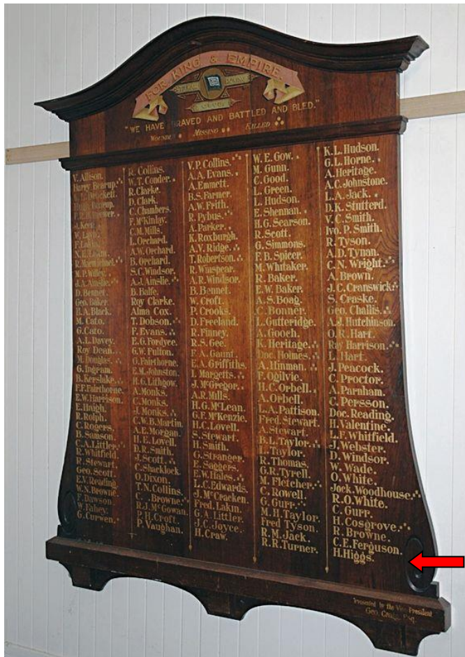
Tamar Rowing Club Roll of Honour

H. Higgs is remembered on the Tamar Rowing Club Roll of Honour, located at Tamar Rowing Club, 14 West Tamar Road, Trevallyn, Tasmania.