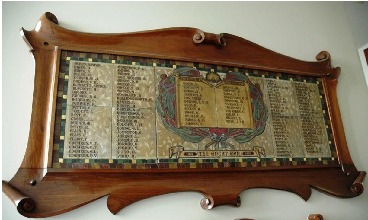
Paterson Street Methodist Church Roll of Honour